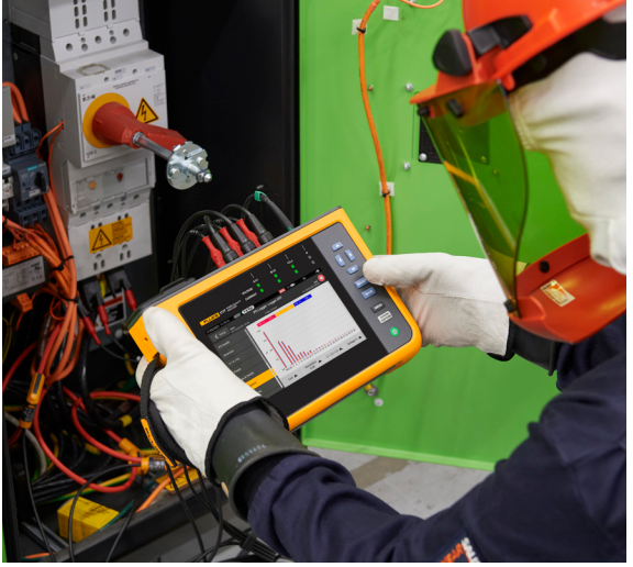
Fluke 1777 Three-Phase Power Quality Analyzers

The additional heat causes issues in cable runs, motor windings, and transformers. The overheating can cause significant damage or complete failure, either of which could lead to unplanned downtime and expensive repairs. To measure and diagnose harmonics, use a Fluke 1770 Series Three-Phase Power Quality Analyzer.